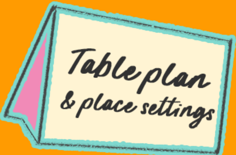
Table plan & place settings